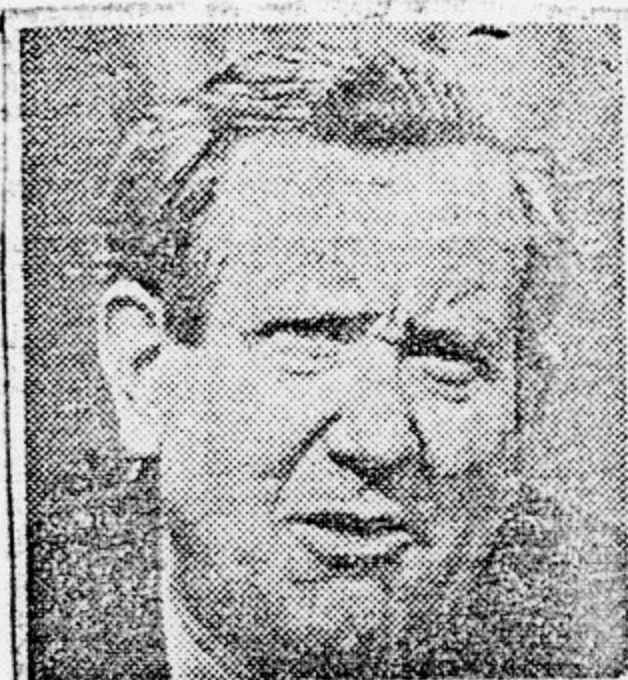
Mr. P. Faulkner, Minister for Posts and Telegraphs